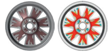
TOP: Using Altair Inspire, Renault was able to achieve a significant lead time reduction. BOTTOM: Accelerated process design of Renault rims thanks to optimization with Altair Inspire.